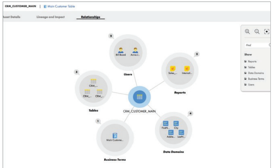
Figure 2: Enterprise Data Catalog 360° view.

Moving existing workloads and data sets to the cloud can improve agility and decrease costs. Informatica powers enterprise data management initiatives and future-proofs your IT investment when migrating on-premises data and workloads to Google BigQuery. Hundreds of prebuilt connectors are available, including native BigQuery connectors for Informatica Intelligent Cloud Services SM , Big Data Management ® , and PowerCenter ® . With high-performance data integration, you can accelerate the process of migrating a wide variety of data workloads to Google BigQuery from on-premises applications, relational databases, and data warehouses.